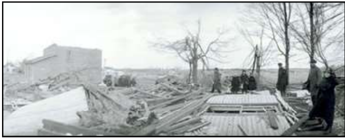
A 1920 tornado destroyed most of Brunersburg.